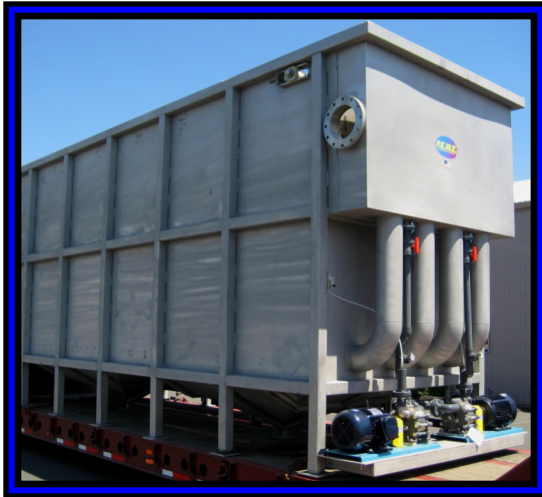
PEWE Nx 2 JEM ® AS-800 Dissolved Air Flotation unit.